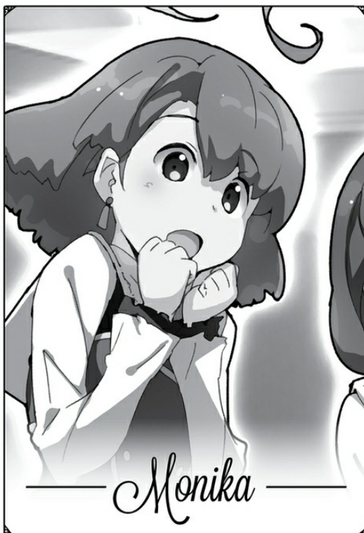
— Monika —

The king's third daughter. Intrigued by Adele.